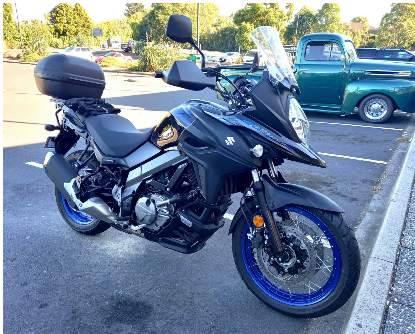
V Strom 650cc