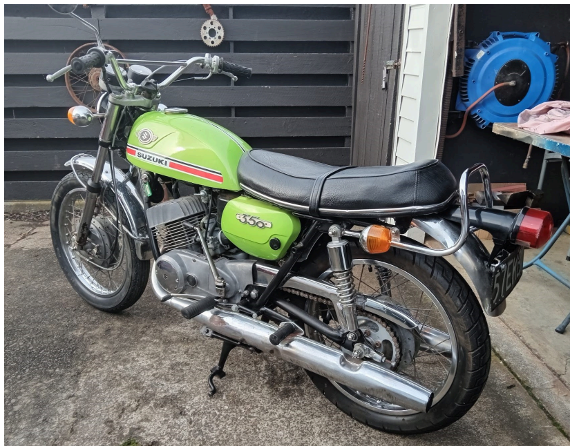
Suzuki T350 2 stroke