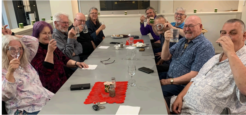
Drinks sculled and everyone's happy!

it's....entertaining! Check our Events page for details.